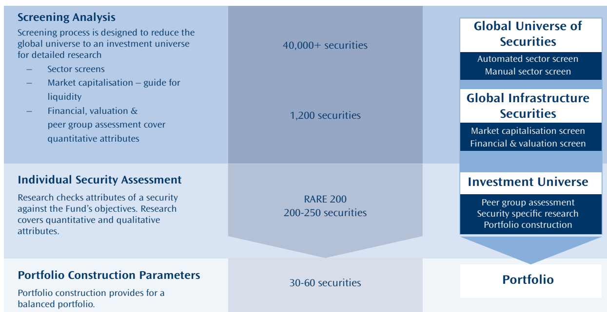
Table 2: Outline of RARE investment process.